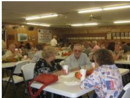
We served 157 folks who lingered to enjoy desserts, friends, and the spirit