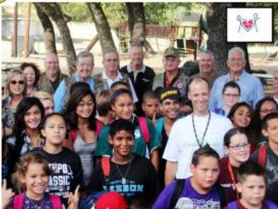
August 15, 2011

The theme for August is a focus on Youth. Members of the Bulverde Lions Club visited the St Jude's Ranch for Children on August 15th, 2011 and cooked hotdogs for 42 children.